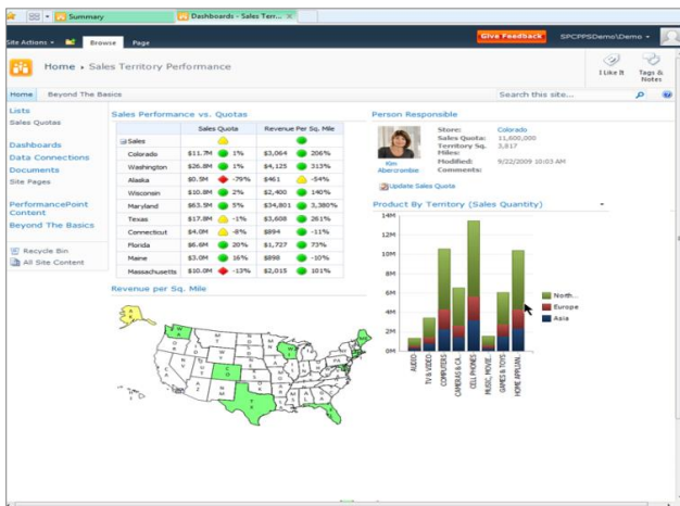
The Team Dashboard in SharePoint 2010 provides a highly visual view of your data.